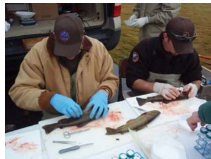
SBWRD and DWR staff collecting Brown Trout from East Canyon Creek.