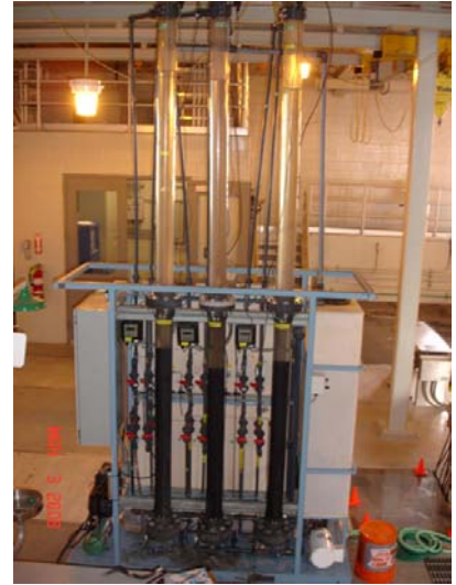
Granular Activated Carbon Pilot Testing at the ECWRF.