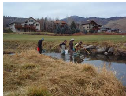
Fish sampling in East Canyon Creek.