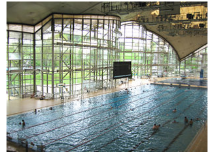
A concentration of one part per trillion is equivalent to one drop diluted into 20 Olympic sized swimming pools.

Based on the sampling results, the District contracted with the Utah